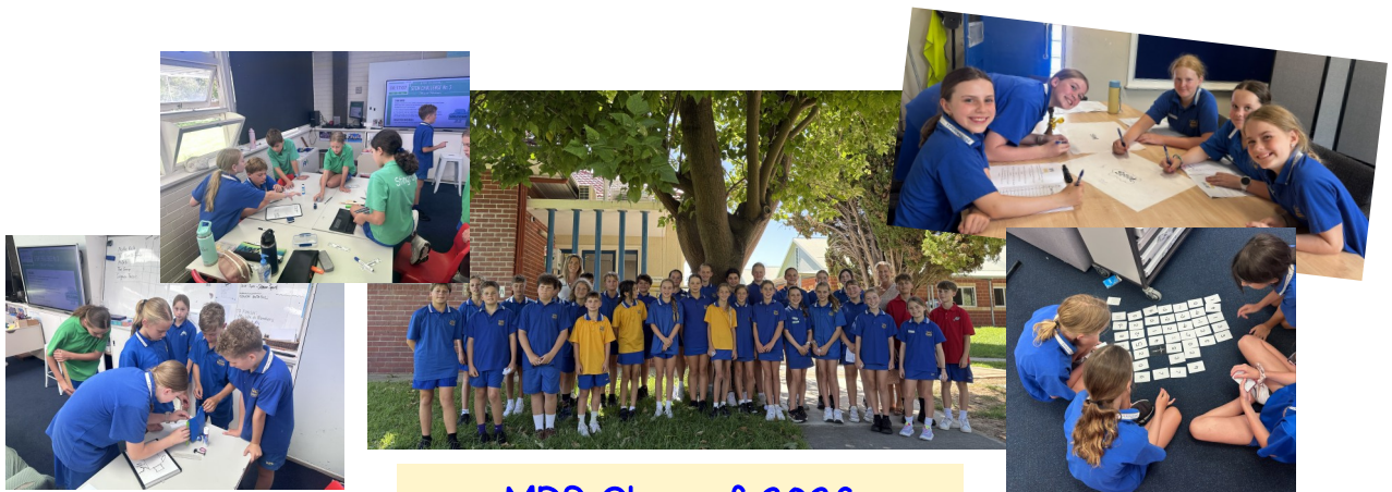
MPS Class of 2026

As we move through this period of transition, our priority is to maintain stability and continuity. We will continue to consolidate the policies, programs and practices that have been thoughtfully implemented over the past four years, while preserving the strong sense of calm, collaboration and student focus that has always been in place at Marmion.